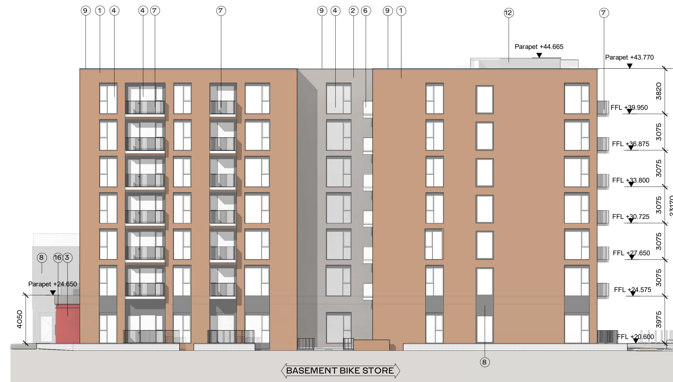
2 Block Elevation BG2 01 North Elevation 1 : 200