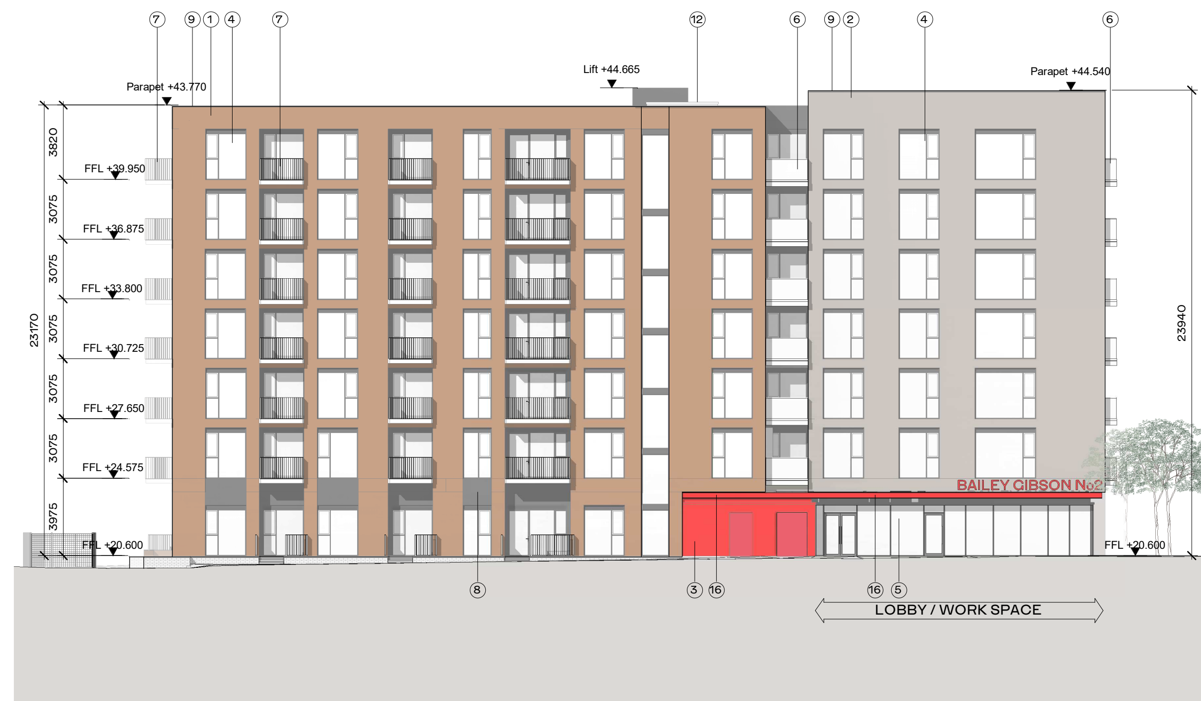
4 Block Elevation BG2 01 West Elevation 1 : 200